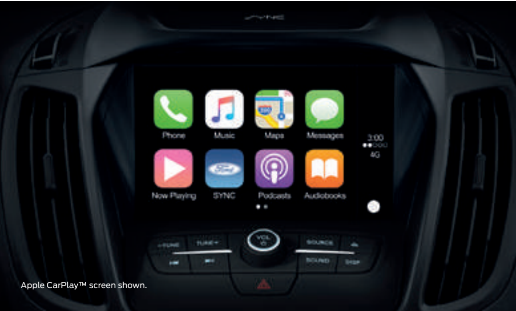
Apple CarPlay™ screen shown.

Are your kids old enough to borrow the car? Program Escape's MyKey to limit top speed and regulate stereo volume.