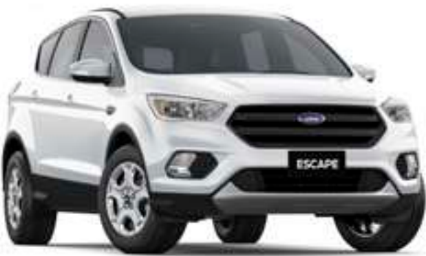
Escape Ambiente shown in Frozen White.

Wheels shown, not available in New Zealand. Please refer to page 27 for New Zealand wheels.