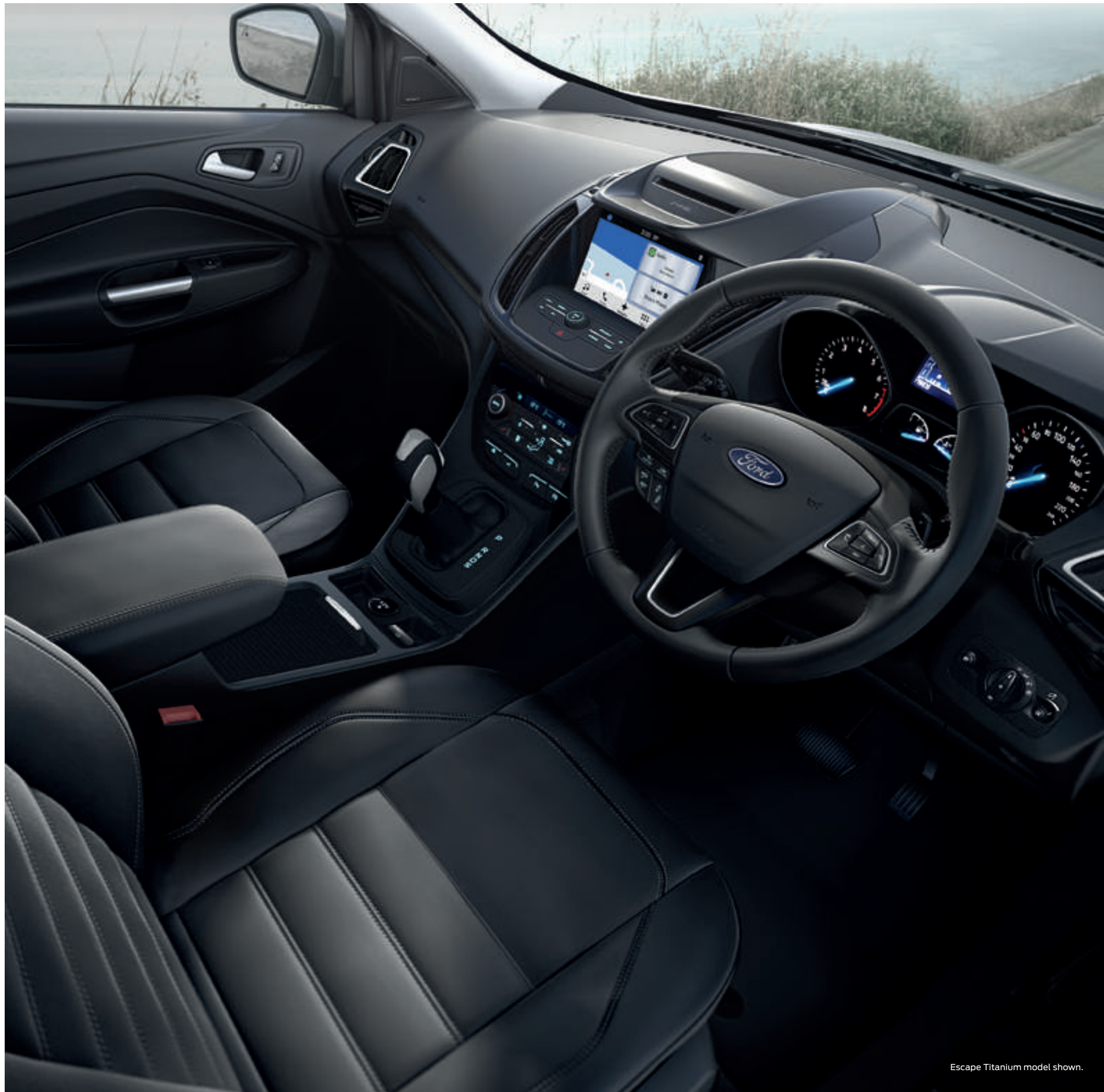
Escape Titanium model shown.