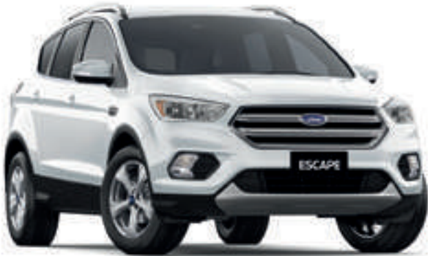
Escape Trend shown in Frozen White.