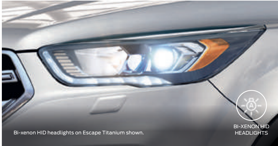
Bi-xenon HID headlights on Escape Titanium shown.