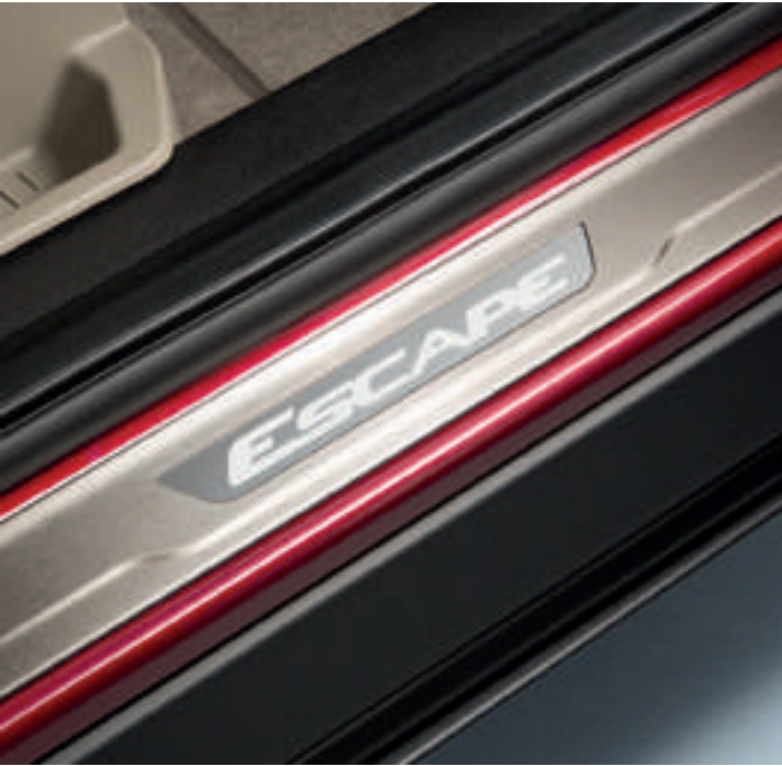
Scuff plates. Elegant polished stainless steel scuff plates, with etched 'Escape'.