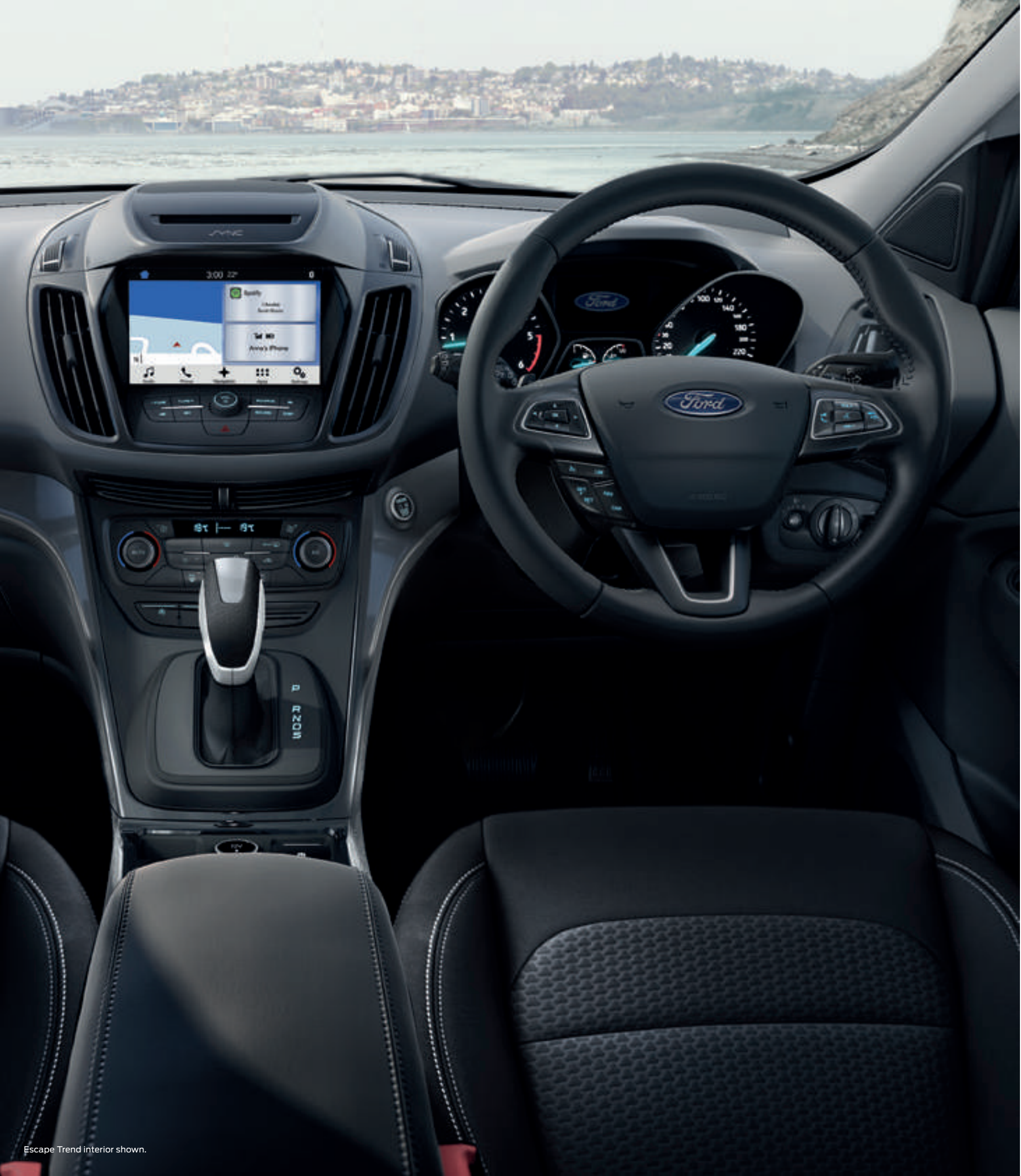
Escape Trend interior shown.