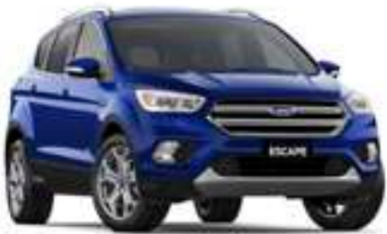
Deep Impact Blue