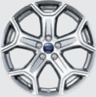
Titanium 19" Alloy wheel