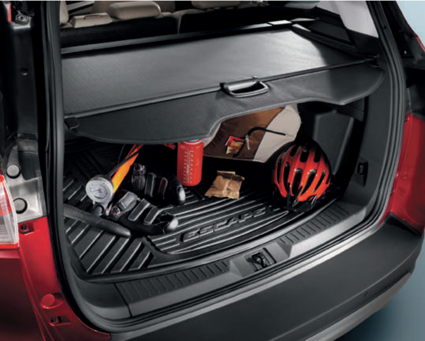
Waterproof luggage compartment mat. Keep your boot clean and pristine whatever the weather, with an anti-slip mat tailored to fit the Ford Escape perfectly.