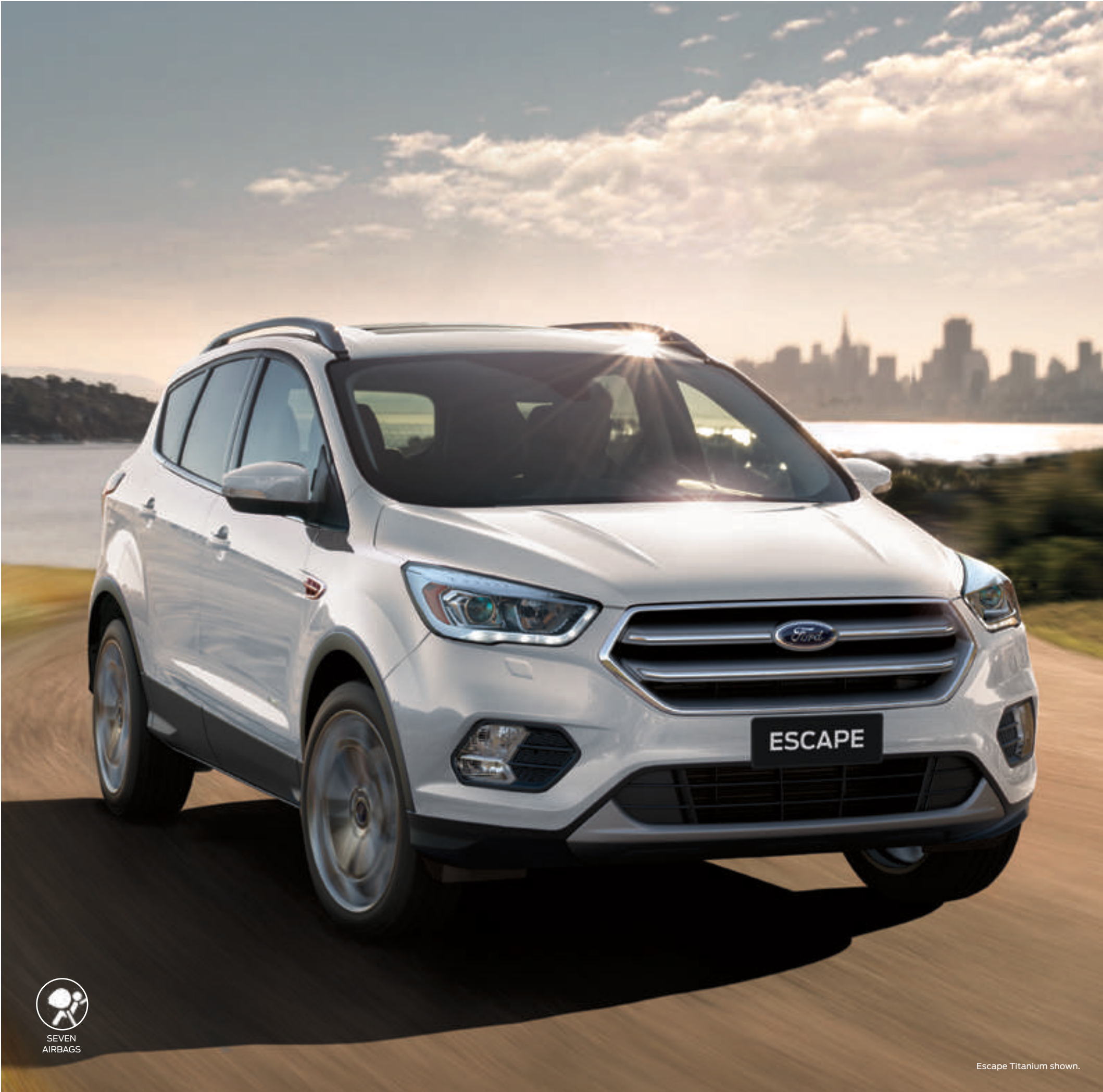
Escape Titanium shown.