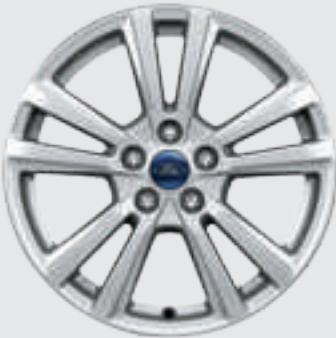
Ambiente 17" Alloy wheel