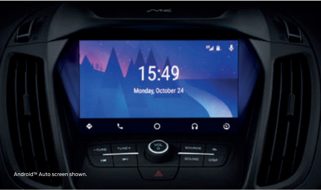
Android™ Auto screen shown.