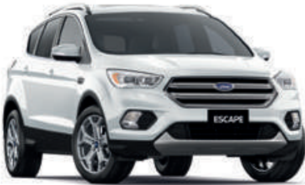
Escape Titanium shown in Frozen White.