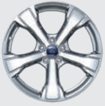
Trend 18" Alloy wheel