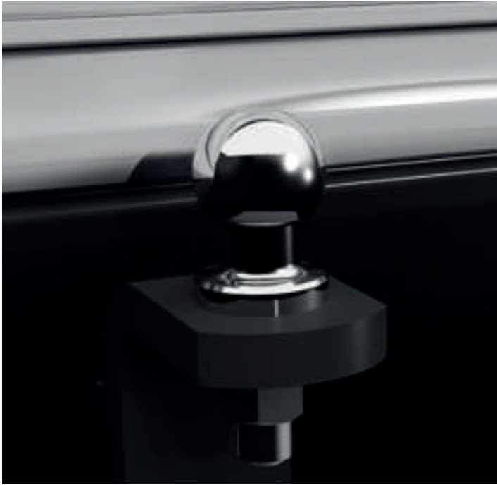
Tow Pack. Whether your towing requirements are for work or play, the Genuine Ford Tow Pack will make towing a breeze.