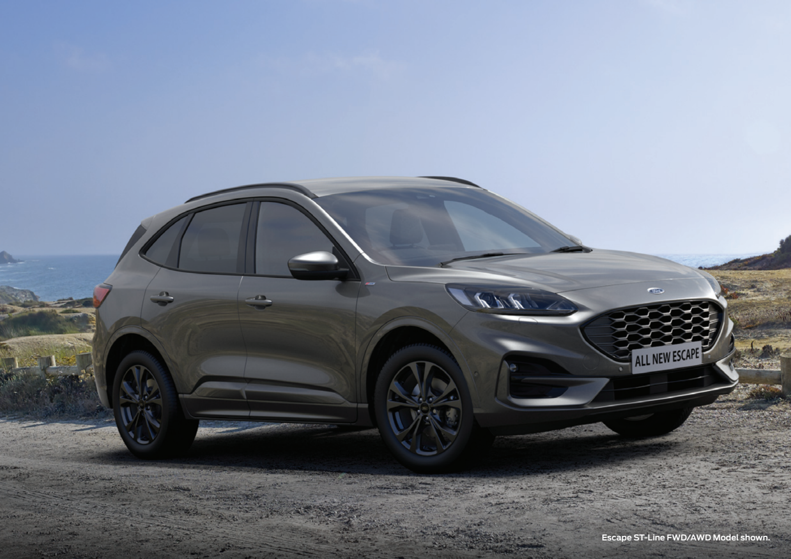
Escape ST-Line FWD/AWD Model shown.