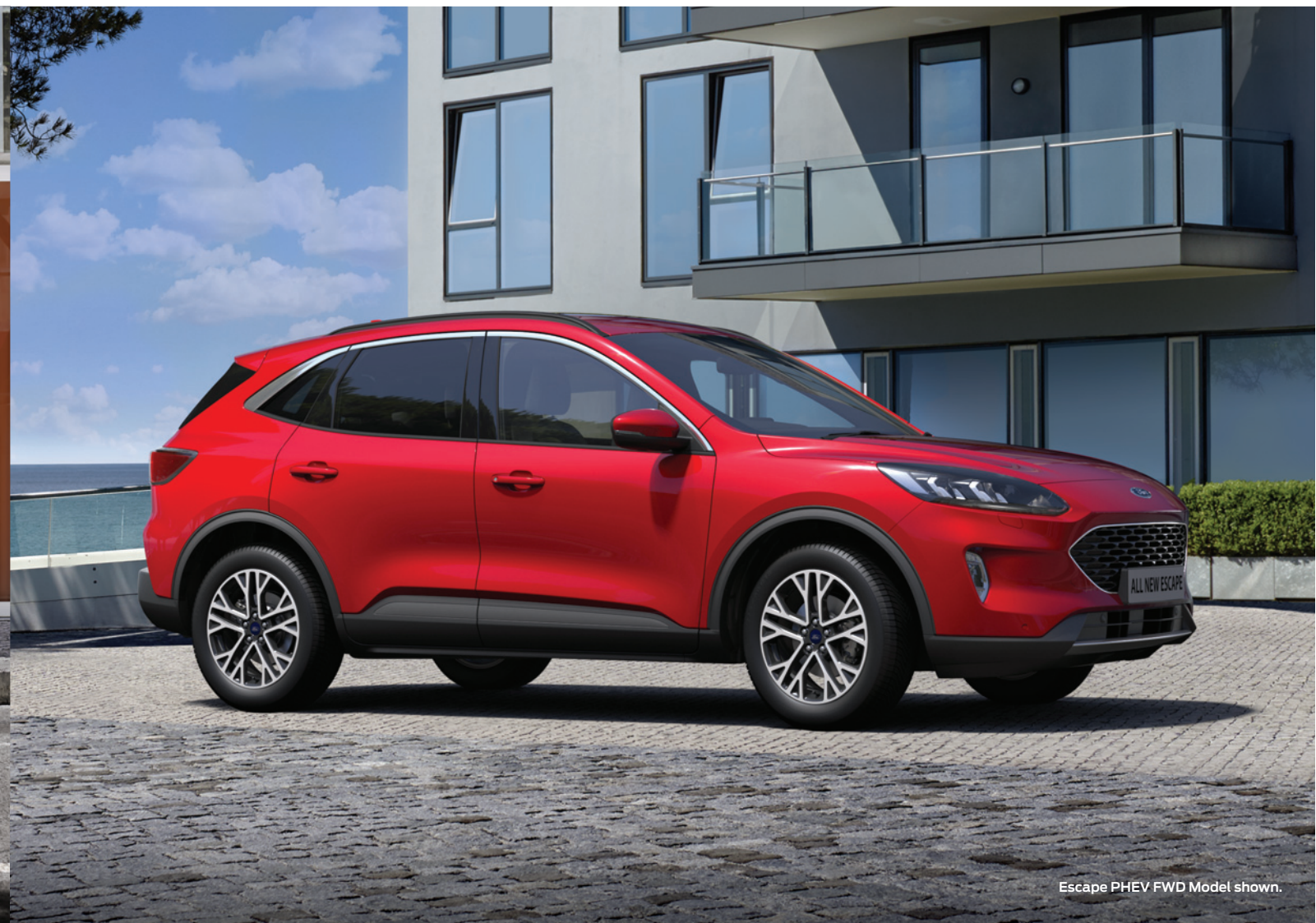
Escape PHEV FWD Model shown.