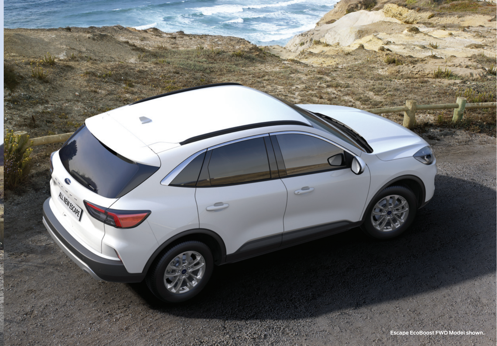
Escape EcoBoost FWD Model shown.